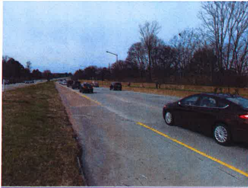
APPROACH "A" END WBL