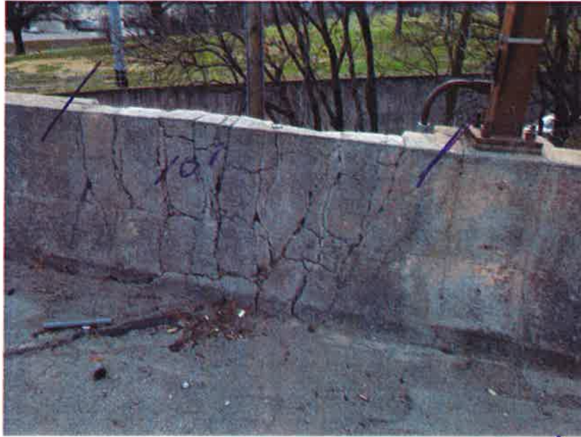
BRIDGE PARAPET "A" RT. W/ IMPACT DAMAGE EBL